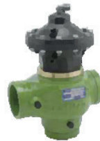
Victaulic 3" x 2"