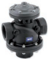
2" x 2"