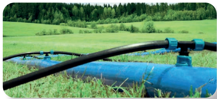
PRE-HOLED BLU TD-FLAT LAYFLAT PRE-INSERTED STARTER 1/2" F - ROLLS 100 MT

Recommended dripline start fittings: for tape: RMP639 - RMP640 - RMP641 - RMP642 for dripline: RMP631 - RMP632 - RMP637 - RMP638